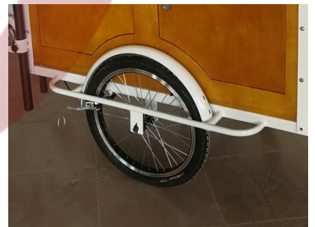
- Wheel -