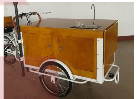
- Cabinet -