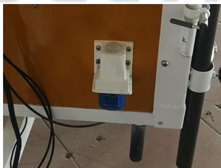
- Generator Socket -