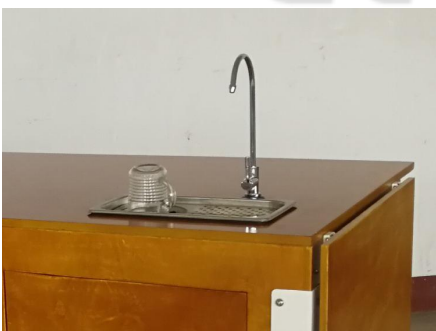
- Water Sink -