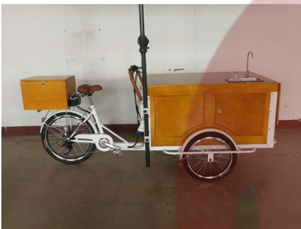
- Cart -