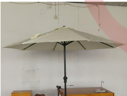
- Umbrella -