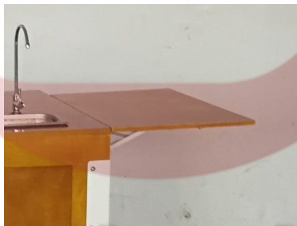
- Extendable Table -