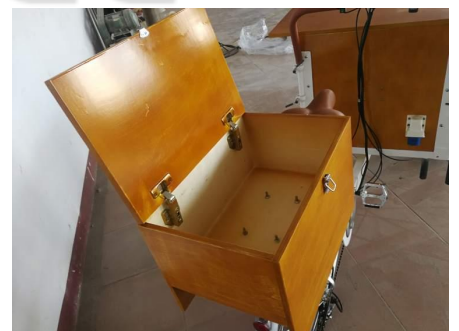
- Rear Box -